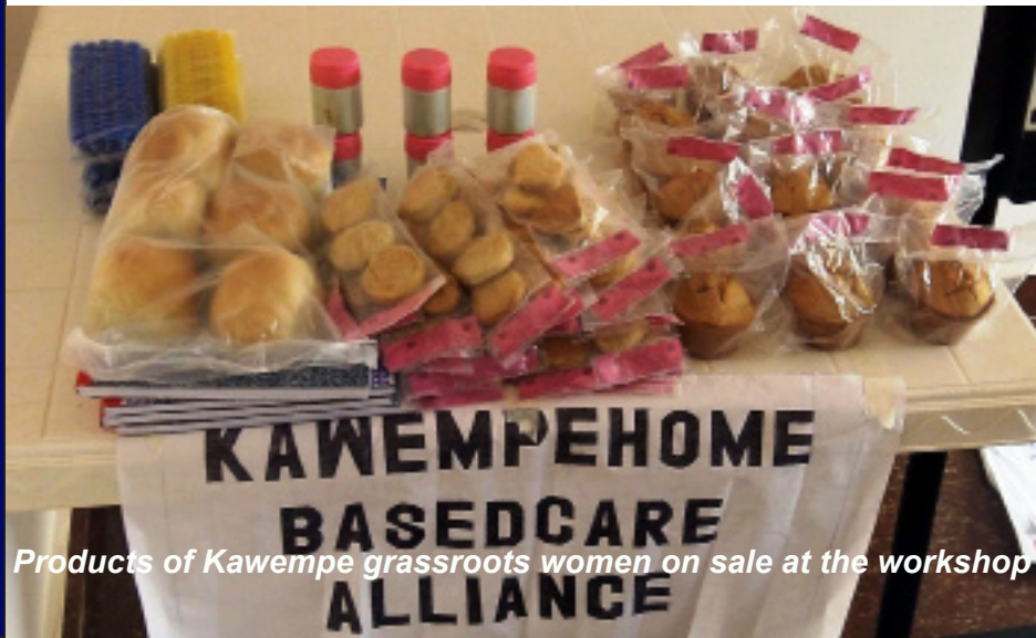
Products of Kawempe grassroots women on sale at the workshop

Besides sharing best practices and learning about the goal/objectives of HBCA and HBC, participants acquired knowledge of formulating an alliance, effective advocacy, networking, communication and lobbying for their respective alliances' sustainance.