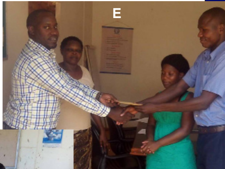
E - UCOBAC Health Officer ( on the left ) hands over start up capital to Mbuya Youth Group chairperson.