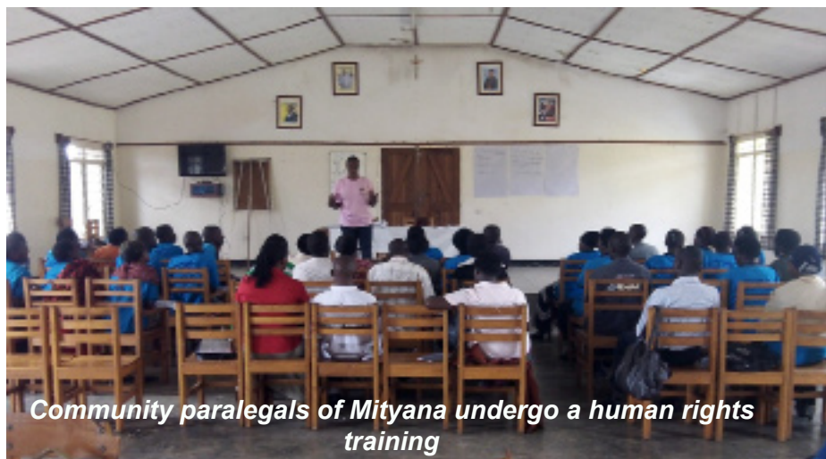
Community paralegals of Mityana undergo a human rights training

In promoting women's land and property rights in their respective communities, each team of community paralegals in Mubende, Kiboga and Mityana under UCOBAC received a 2-day refresher training on WLPR in the areas of; gender analysis, human rights, women's rights, domestic relations and women's property rights, succession law, women's land and property justice, ADR.