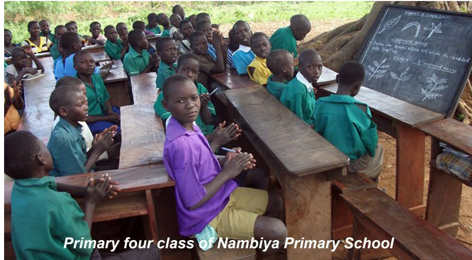
Primary four class of Nambiya Primary School

Its major areas of focus included; education, nutrition, health, livelihoods/food security, capacity building and public engagement sectors.