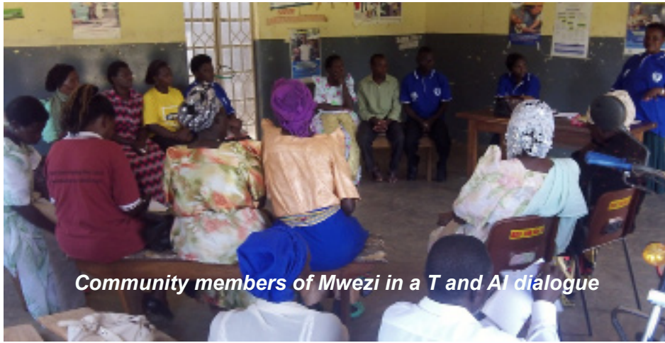
Community members of Mwezi in a T and AI dialogue

In 2013, UCOBAC implemented a one-year pilot study of the Transparency and Accountability Initiative in Bukomero and Dwaniro sub-counties – Kiboga District.