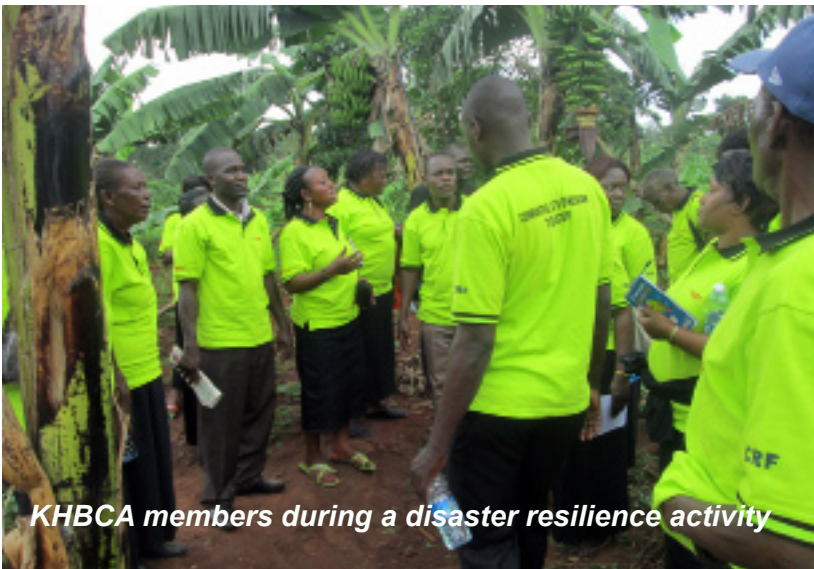
KHBCA members during a disaster resilience activity