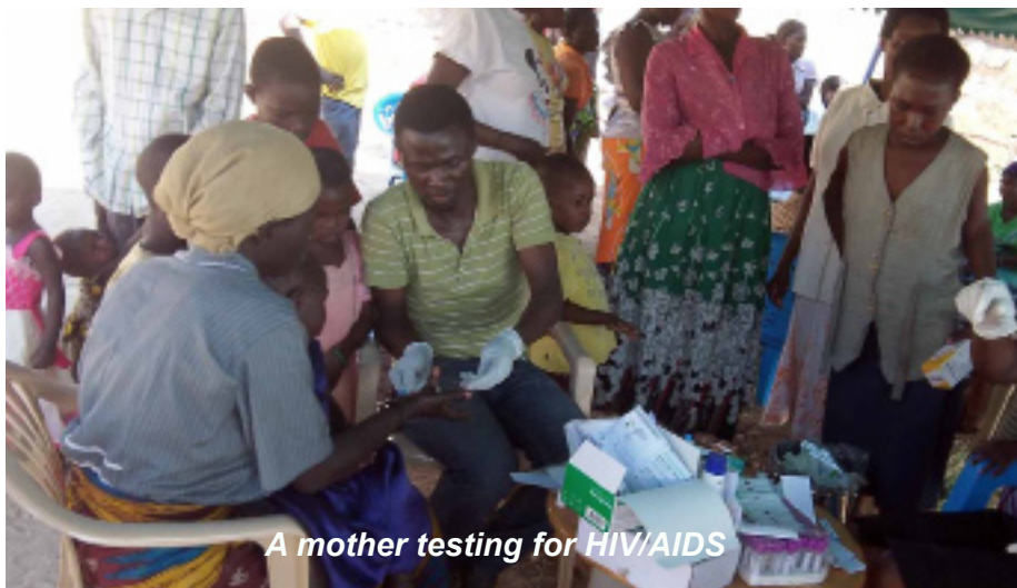
A mother testing for HIV/AIDS

300+ community members of Katoogo Zone in Kinawataka were beneficiaries of free medical health services provided by UCOBAC and Uganda Health Marketing Group (UHMG) in July 2013.