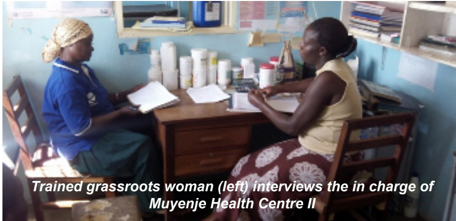
Trained grassroots woman (left) interviews the in charge of Muyenje Health Centre II

UCOBAC aims at promoting good governance by supporting grassroots women at the local level to implement anti-corruption strategies that will induce improved service delivery and access to justice.