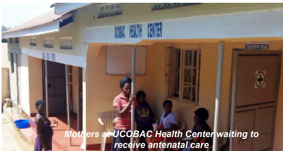
Mothers at UCOBAC Health Center waiting to receive antenatal care

Besides being cautioned against usage of local herbs, self medication and failure to complete prescribed dosages; communities received general medical care for ailments such as; malaria,