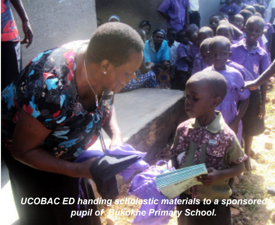
UCOBAC ED handing scholastic materials to a sponsored pupil of Bukokhe Primary School.