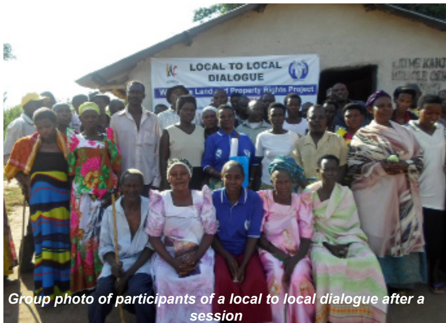
Group photo of participants of a local to local dialogue after a session

Several cases regarding land and property are being addressed by the administrative justice institutions.