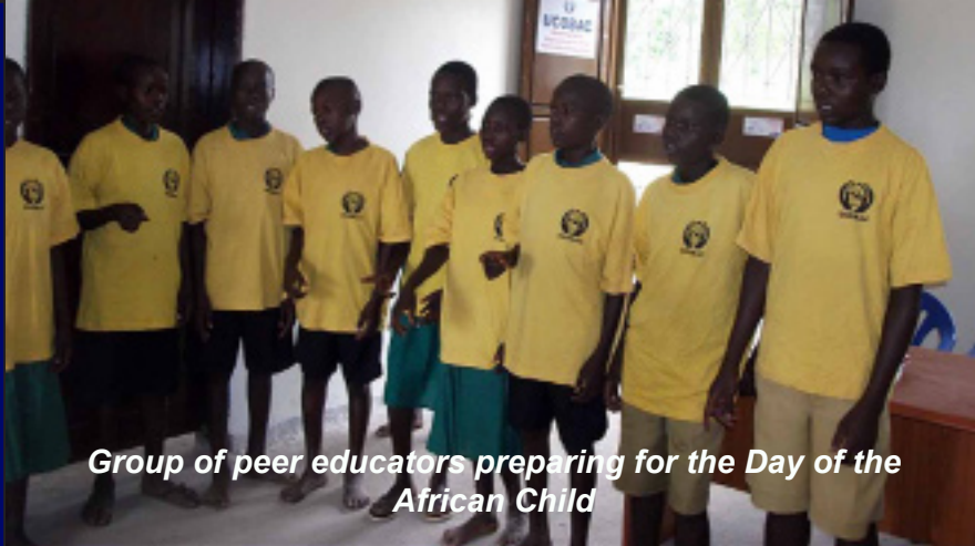
Group of peer educators preparing for the Day of the African Child