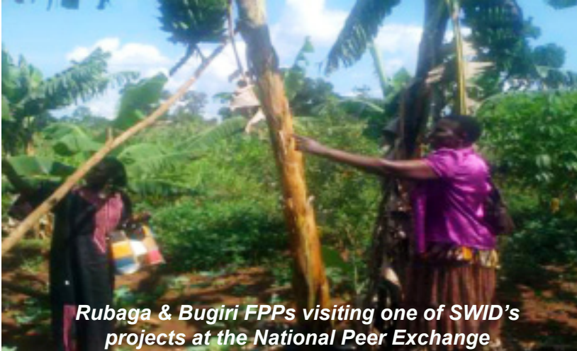
Rubaga & Bugiri FPPs visiting one of SWID's projects at the National Peer Exchange