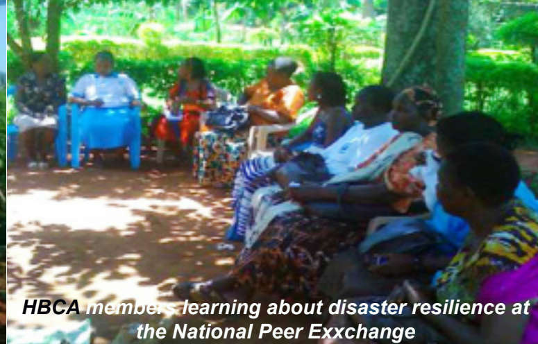
HBCA members learning about disaster resilience at the National Peer Exchange