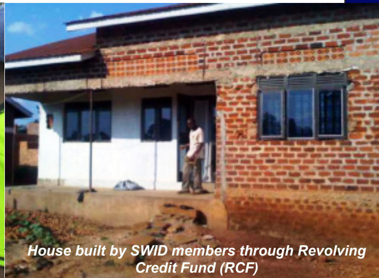
House built by SWID members through Revolving Credit Fund (RCF)