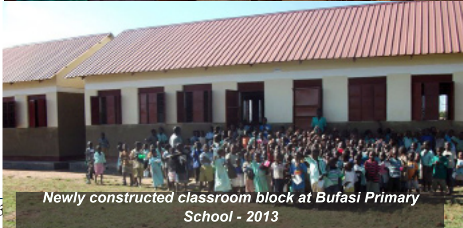
Newly constructed classroom block at Bufasi Primary School - 2013