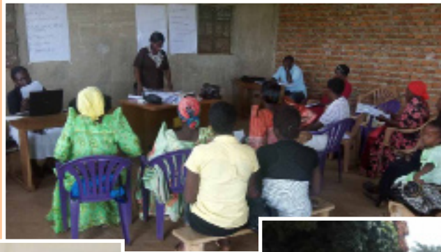
A leaders dialogue in Bugiri district