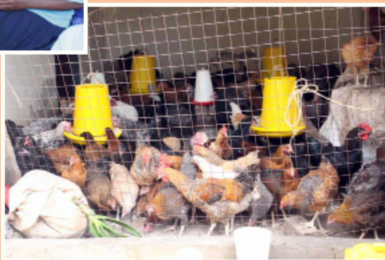
A poultry project