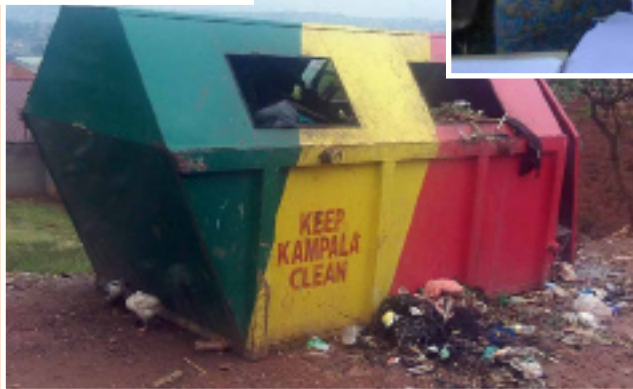
Community garbage collection trunk provided by KCCA to promote CDR activities in Nakawa

In support and recognition of grassroots women's contribution to the development of their communities through active engagement in disaster resilience activities, the Local Governments of Bugiri and Kiboga districts allocated land for resilience activities to women groups.