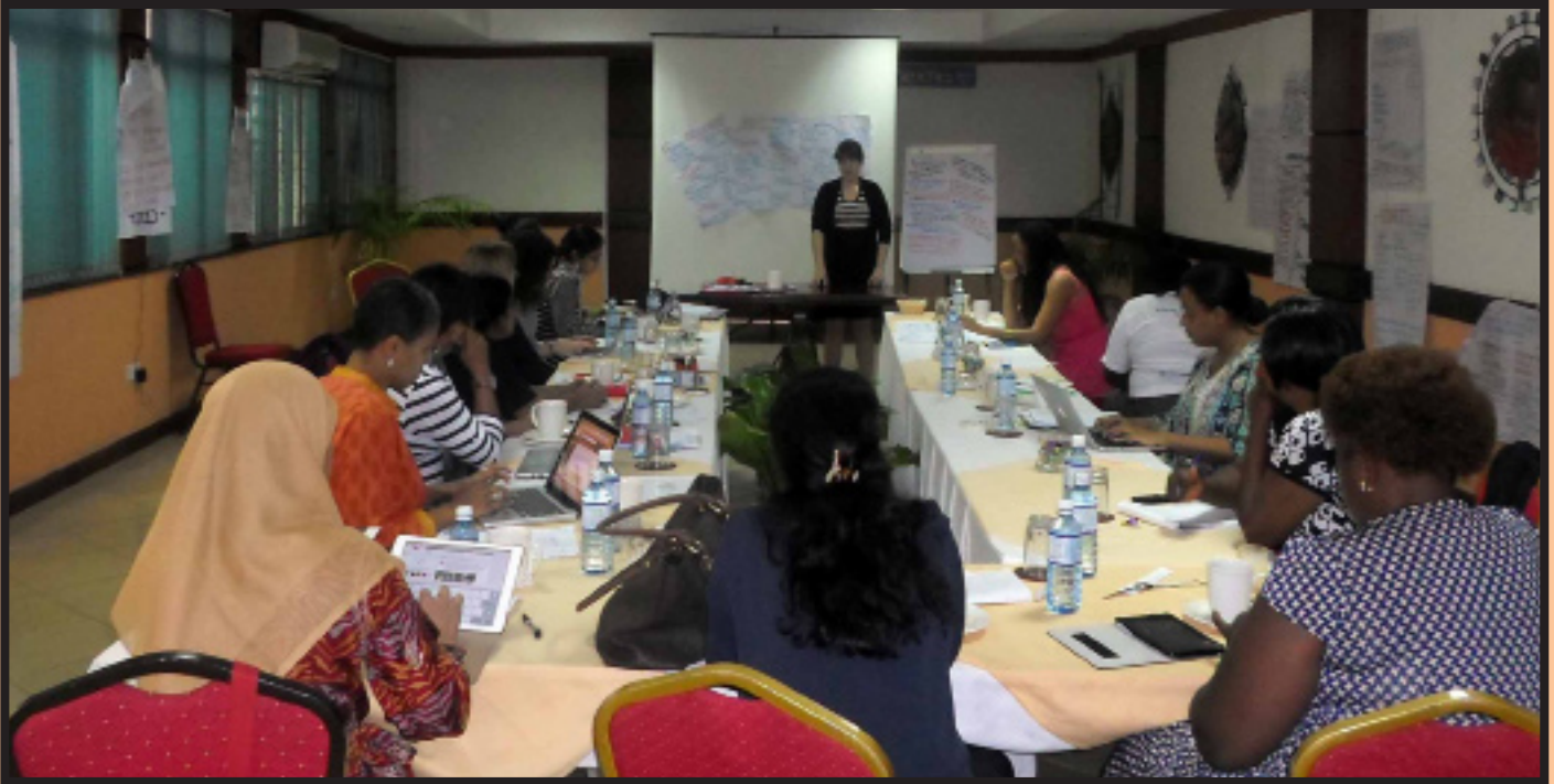
Grassroots leaders participating in the T and AI urban exchange

April 2015: Grassroots leaders implementing Transparency and Accountability Initiative (T and AI) came together in Nairobi - Kenya to collectively exchange ideas, experiences and lessons learnt relating to governance and anti-corruption activities. The 2 - day exchange at Grace House was attended by partners from GROOTS Kenya, the Huairou Commission (HC) and Best Practices Foundation (BPF).