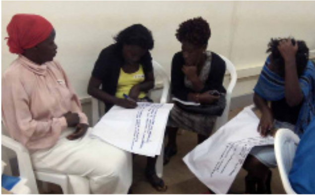
A group discussion during one of the CDR trainings