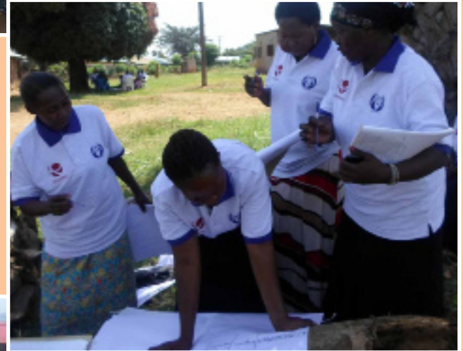
Trained CDR ambassadors planning for an activity - Kiboga