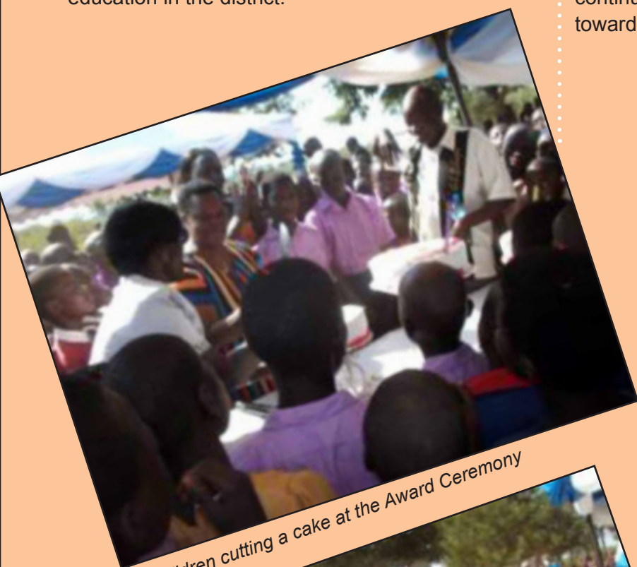
Children cutting a cake at the Award Ceremony

This motivational activity was used as an opportunity for encouraging children to stay in school and complete the primary cycle as well as work hard in school for good grades and prepare for bright futures. Children were also encouraged to continue serving as child ambassadors. The occasion was attended by local leaders from village to district level who appreciated UCOBAC efforts in promoting education in the district.