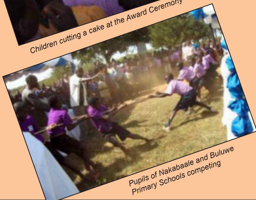
Pupils of Nakabaale and Buluwe Primary Schools competing