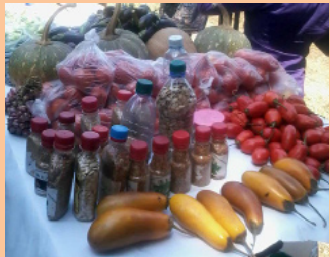
Pics of products made by members of KEA

KEA) is a developmental Community Based Organization situated in Kikandwa sub-county, Mityana district. It works to address rural development issues and natural resource management through promoting agriculture to ensure food security, income generation and natural resource preservation. Members of KEA and the communities surrounding benefit from having the organization in their midst as it looks out for their welfare through different strategies such as; setting up a community school, a plant nursery supermarket (where various improved and indigenous seed varieties are grown and availed), forest reserve, demonstration banana plantation garden among others.