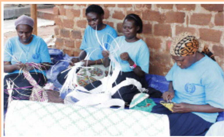
Women engaged in crafts making

Watch Mbuya HBCA in Action on: http://www.universitasforum.org/index.php/ojs/article/view/164/579